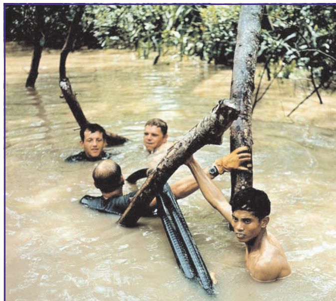
RAN and Army of the Republic of Vietnam (ARVN) personnel attaching charges to wooden stakes. The Vietcong drove wooden stakes into the river bed to obstruct local traffic.

A series of validation studies were undertaken to assess the reported elevated rates of illness. The number of validated cases of melanoma and cancer of the prostate were significantly higher than expected. 11 There were 483 validated cases of melanoma compared with 380 expected cases according to community norms (95% CI, 342–418). For cancers of the prostate, 212 cases were validated and 147 expected (95% CI, 123–173). However significantly fewer lung cancers, soft tissue sarcomas, and cancers of the testis were observed than expected. For lung cancer, the authors noted that the fewer than expected cases was probably an artefact due to a number of veterans having died from lung cancer and consequently having been missed by the morbidity study. The number of confirmed cases of leukaemia was within the expected range, although the number of cases of chronic lym-