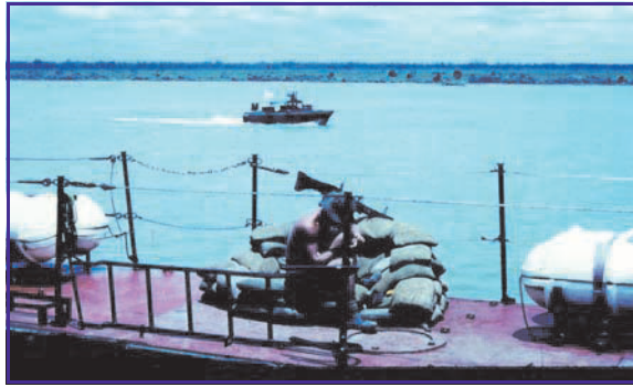
The Army Vessel (AV) 1355 Vernon Sturdee on the Mekong River, 1967, with US riverine boat. Note the defoliated riverbanks and lack of protective clothing worn by the gunner.

In the latest update of Veterans and agent orange , 16 five diseases were classified as having sufficient evidence of an association with herbicide exposure. These diseases are: chronic lymphocytic leukaemia, soft-tissue sarcoma, non-Hodgkin's