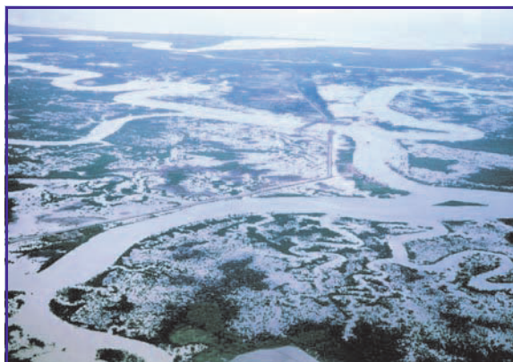
Aerial view over Rung Sat (foreground) and Vung Tau (background) at high tide. Tropical Vietnam presented many natural hazards to the Australian troops, and the herbicides, pesticides and prophylactic medicines used in response were themselves not without dangers.

However, the study did describe a statistically significant increase in pancreatic, lung, and brain cancers among National Service veterans compared with National Service non-veterans.