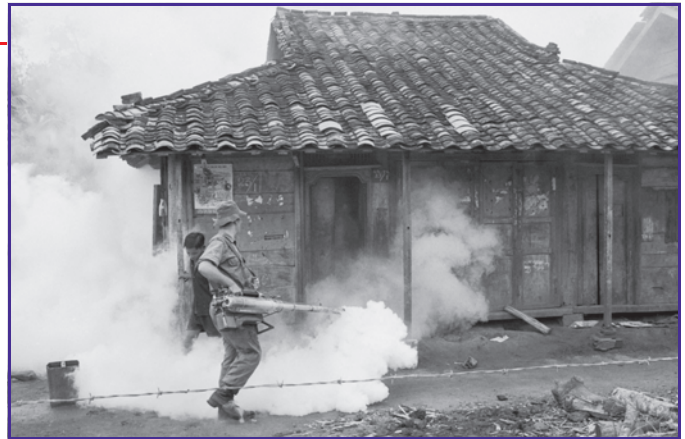
Fogging a Vietnamese village house in Phuoc Tuy province. Insecticides, usually DDT, were used to reduce the incidence of malaria.