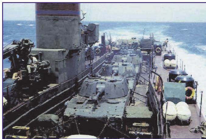
Cargo of Centurion tanks en route to Vung Tau in 1969 on Army vessel 1356 Clive Steele.

This association was not seen among all veterans or Regular Army veterans. As 29 different cancer sites were tested for significant association, the authors reasoned that the three cancers showing increased rates could be a statistical anomaly. In addition, the authors concluded that, given the follow-up period was at most 24 years, it was too early to expect a significant increase in rates of solid cancers.